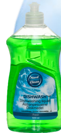
622058 Dishwashing liquid concentrate fresh 500 ml display