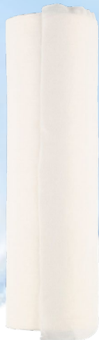
637117 Cleaning cloth roll 50 sheets/roll