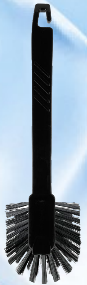
601360 Dish brush black display