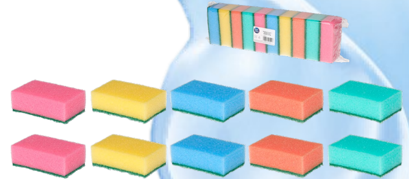
274088 Scouring sponge 10 pcs display