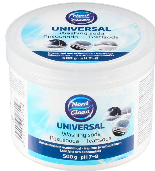
626815 Washing soda 500 g display

Suitable for many surfaces, including removing burnt food from pots and stoves.