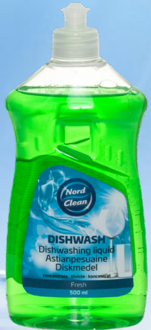
622058 Dishwashing liquid concentrate fresh 500 ml display

The metal grease filter of the cooker hood should be washed with dishwashing liquid and a brush, and the cooker hood wiped with a microfiber cloth or a lint-free cleaning cloth.