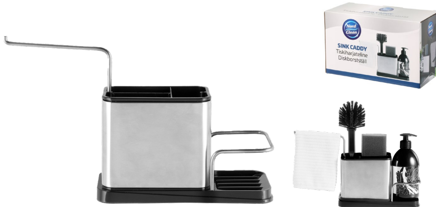
614479 Sink caddy

Every home needs an effective and economical dishwashing liquid and a good dish brush. A handy sink caddy brings order and style to the sink area.