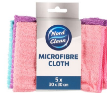
274856 Mikrokuituliina 5 kpl