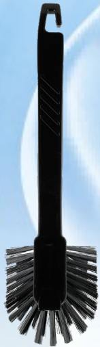
601360 Dish brush black display