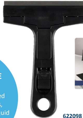
622098 Scraper wide

The blade does not need strong cleaning agents, a drop of dishwashing liquid or cleaning stone foam is enough.