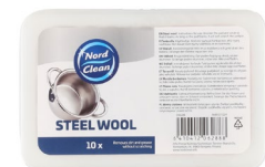
206288 Steel wool soap pads 10 pcs