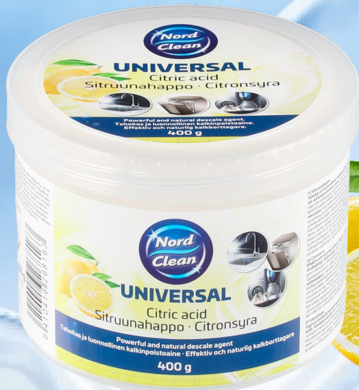
626816 Citric Acid 400 g display

Citric acid is a natural and effective descaler, suitable for cleaning dishwashers as well as coffee makers and kettles.