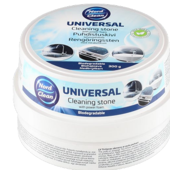
621671 Cleaning stone with power foam 300 g display