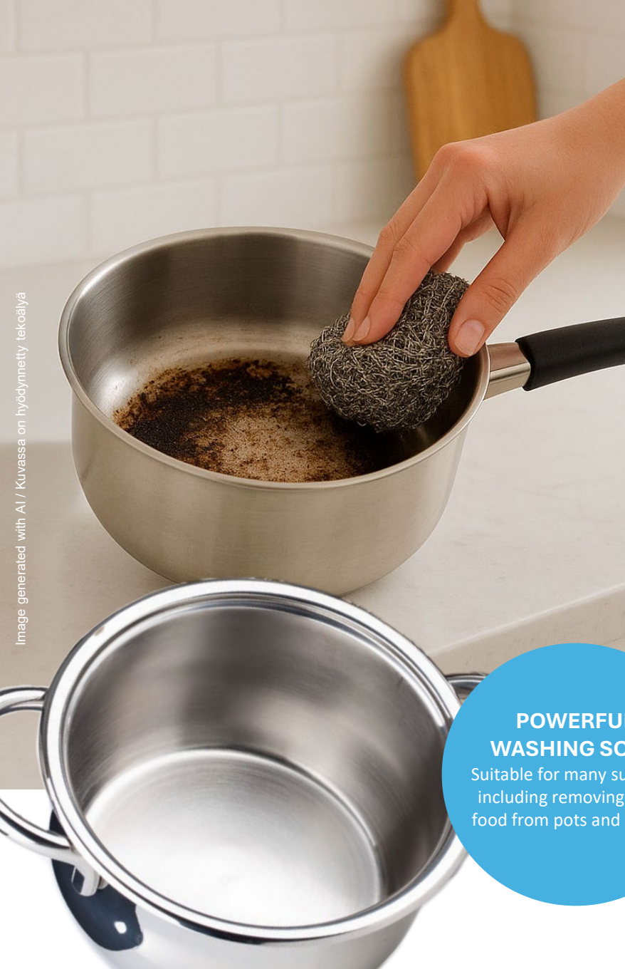
Image generated with AI / Kuvassa on hyödynnetty tekniä

Washing soda, coarse scrubbing pads, and foaming steel wool clean stubborn, burnt-on dirt from stoves and pots.